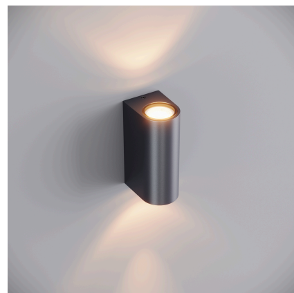
● 3000 K (Warm)