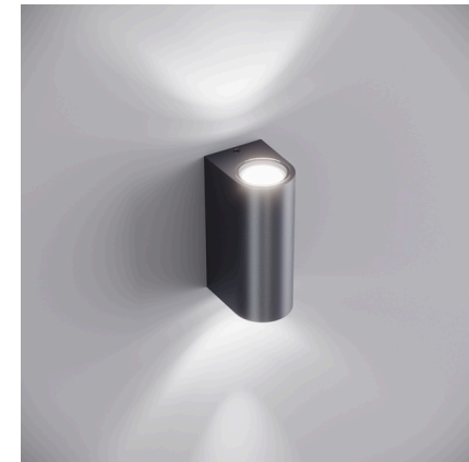
● 6500 K (Cool)