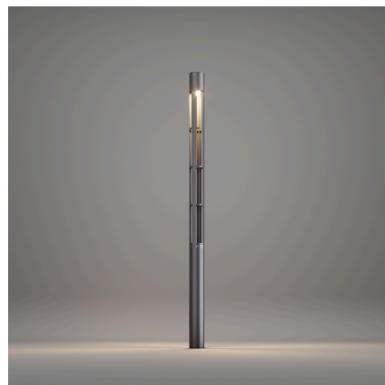
● 2700 K (Warm)