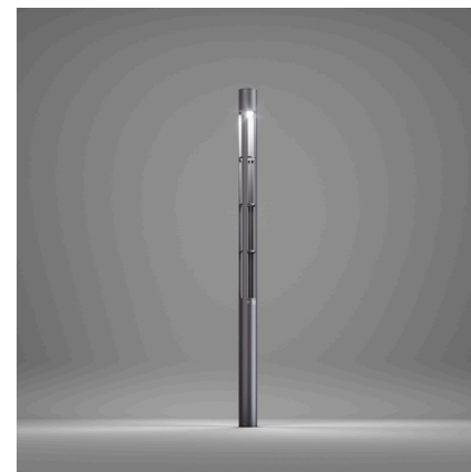
● 6500 K (Cool)