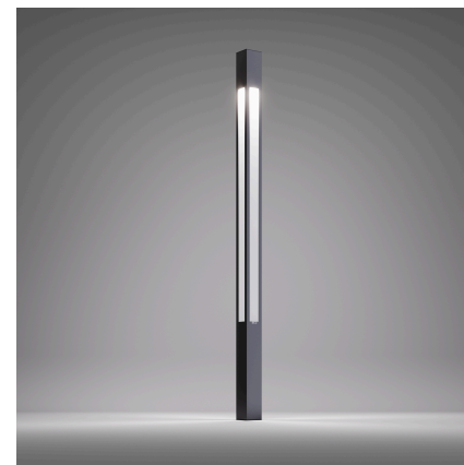
● 4000 K (Neutral)