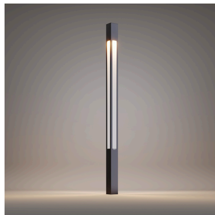
● 2700 K (Warm)