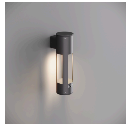
● 4000 K (Neutral)