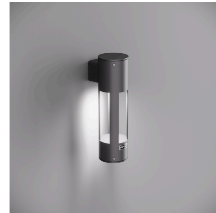
● 6500 K (Cool)