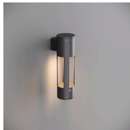
● 3000 K (Warm)