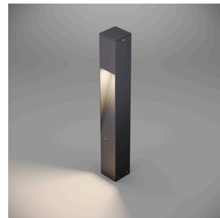
● 4000 K (Neutral)