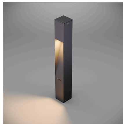
● 3000 K (Warm)