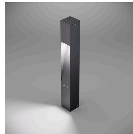
● 6500 K (Cool)