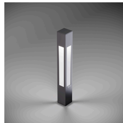
● 6500 K (Cool)