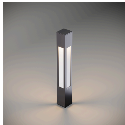
● 3000 K (Warm)