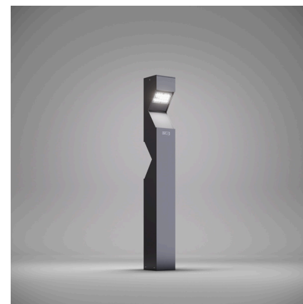
● 6500 K (Cool)