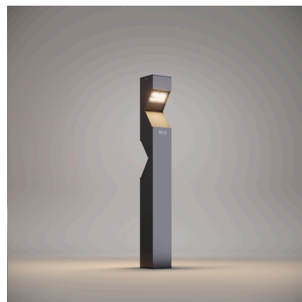
● 3000 K (Warm)