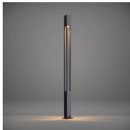
● 2700 K (Warm)