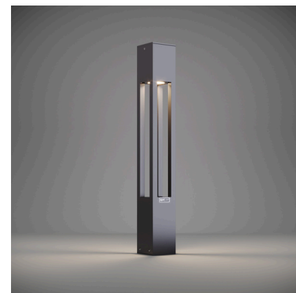
● 4000 K (Neutral)