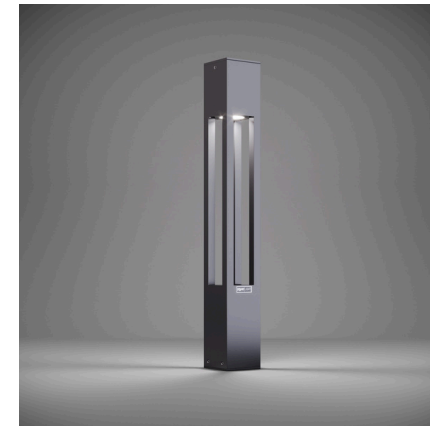
● 6500 K (Cool)