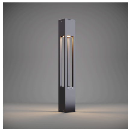
● 3000 K (Warm)