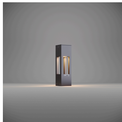
● 3000 K (Warm)