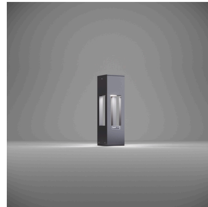
● 6500 K (Cool)