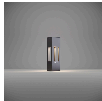
● 4000 K (Neutral)